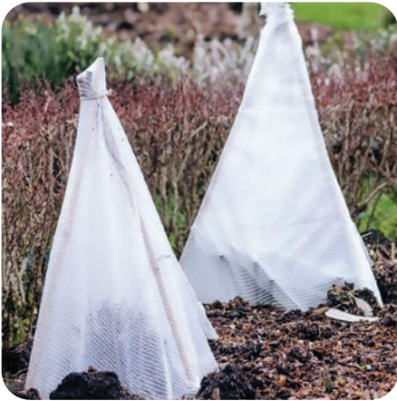
Frost cloth covered plant.

Check Your Zone: Match your plants' hardiness to your site. The Gardens on Spring Creek sit at a USDA Hardiness Zone