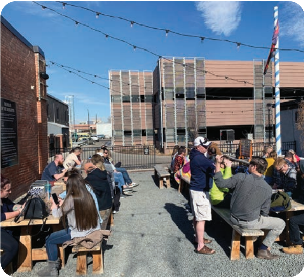
The outdoor patio at Prost Brewing in Fort Collins.