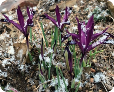
Iris reticulata with snow.

Water Wisely: If you know that inclem- ent weather is on its way, water your plants thoroughly a few days before. Cold stress and drought stress damage plants on a cellular