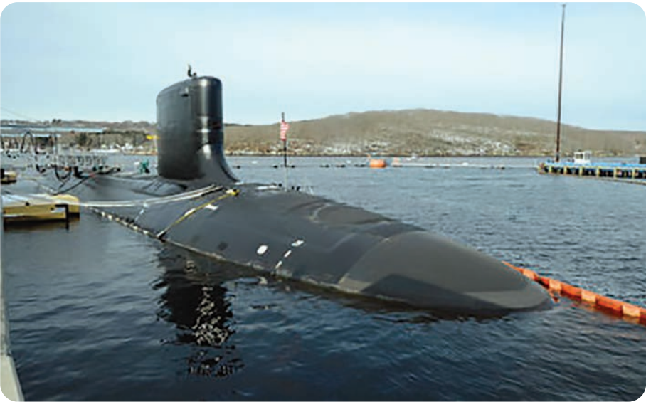
The U.S. Navy attack submarine USS Colorado (SSN-788) sits pierside at Groton, Connecticut (USA), on 15 March 2018, prior to commissioning on 17 March. Colorado was the the U.S. Navy's 15th Virginia- class attack submarine and the second ship named for the State of Colorado.

transfer to the Undersea Warfighting Development Center (UWDC).