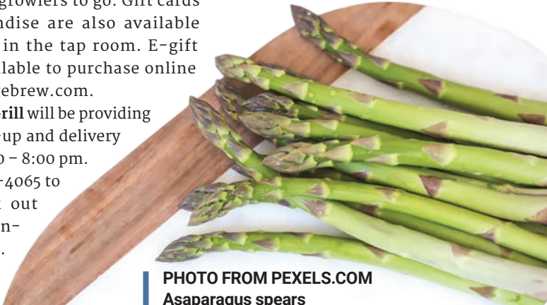
Asaparagus spears

• Ridley's Wellington will remain open during regular business hours daily from 7:00 am – 10:00 pm. The store will open for seniors only on Mondays and Wednesdays from 6:00 – 7:00 am. Online ordering is available at shopridleys.com . • Drive-thru Restaurants will remain open for drive-thru service and hold regular business hours. Gift cards are available at most restaurant locations and are the perfect way to help these businesses get through this difficult economic season. These businesses need us now more than ever before! Look for our new “Take Out and Curbside Pick-Up Available” signs and “Yes, We’re Open” signs around town. The Wellington Area Chamber of Commerce and the Wellington CO Main Streets Program want to thank our communities for their continued support. Follow us on social media @WellingtonMainStreets and @WellingtonanAreaChamberOfCommerce for daily updates on business hours, event postponements and cancellations, and for continued business support. We are here to serve our community and provide innovative ways to keep our business doors open.