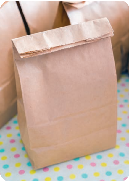
Bagged Meals Available at Wellington Boys and Girls Club for Students