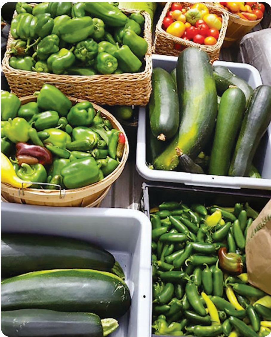
Fresh homegrown produce on its way to the Wellington Food Bank

*A Household is defined as the total number of related or unrelated persons living at the same address who purchase, prepare and consume food together. Household income is the combined income of said persons.