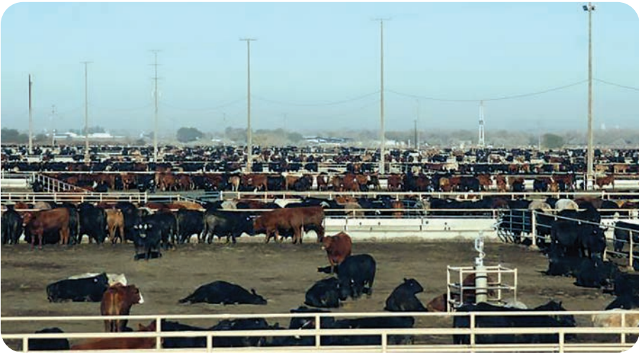
A view of JBS Five Rivers Feedyard

With empty shelves and aisles in gro- cery stores throughout Colorado it may appear that the United States is running out of food. Be assured that there is plenty