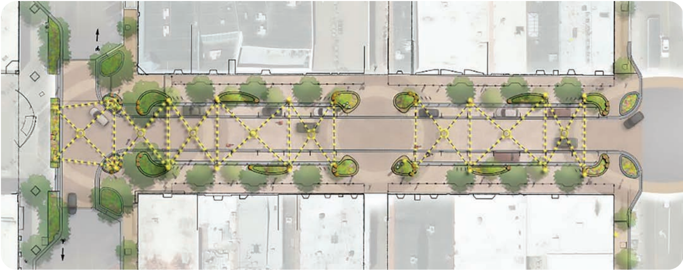
The $3.8M Linden Street Renovation Project would create a "convertible" street.