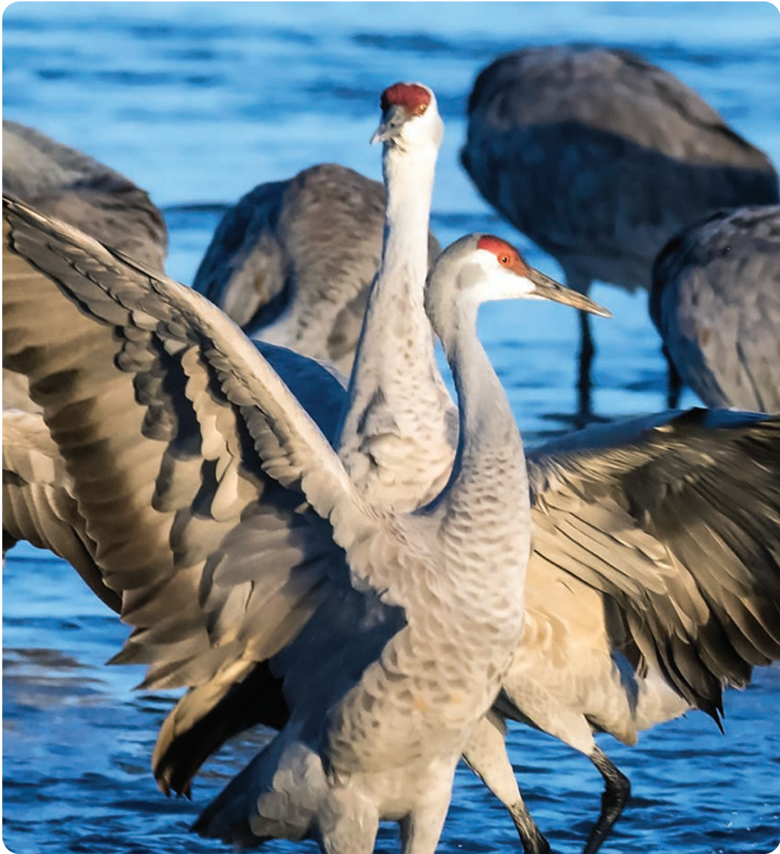
Sand Hill Cranes on the Platte River in March 2020