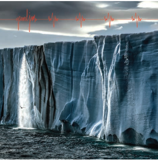
PEARL JAM GIGATON.

Pearl Jam has released the track listing for their much-anticipated eleventh studio album, Gigaton which is set to be released via Monkeywrench Records/Republic Records on March 27, 2020. Produced by Josh Evans and Pearl Jam, Gigaton features 12 tracks including the first single, "Dance of the Clairvoyants". See the full track list below. Gigaton is available for pre-order at www.pearljam.com . Gigaton: 1. Who Ever Said 2. Superblood Wolfmoon 3. Dance of the Clairvoyants 4. Quick Escape 5. Alright 6. Seven O'Clock 7. Never Destination 8. Take The Long Way 9. Buckle Up 10. Come Then Goes 11. Retrograde 12. River Cross