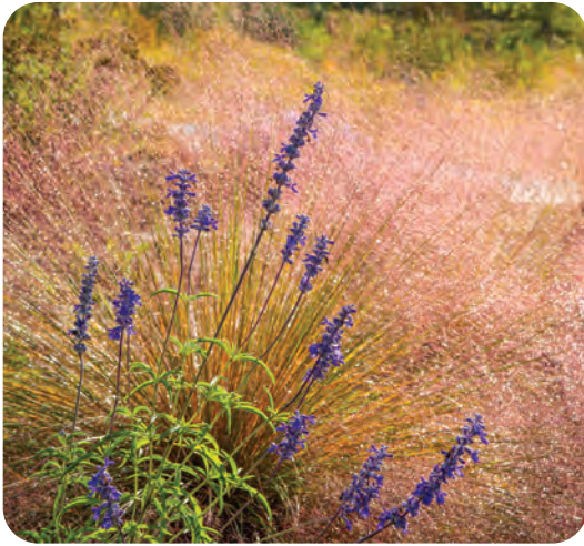
Fine Texture Grasses Prairie

If you've read any of my articles, you've probably heard me rambling on about "fine-textured foliage". I can't help it - foliage texture is an integral part of any design work I do. In fact, it is so important to my process that I consider it in tandem with bloom color and timing when I assess plant choices for a space.