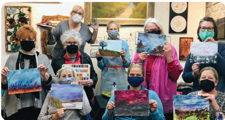
Photo of a recent art class at Blue Moose Art Gallery

whisper in. We gut laugh, get to know our customers, tell stories, play music, have a guessing jar, and host many fun events all year long. Our customers call the gallery their "happy place."