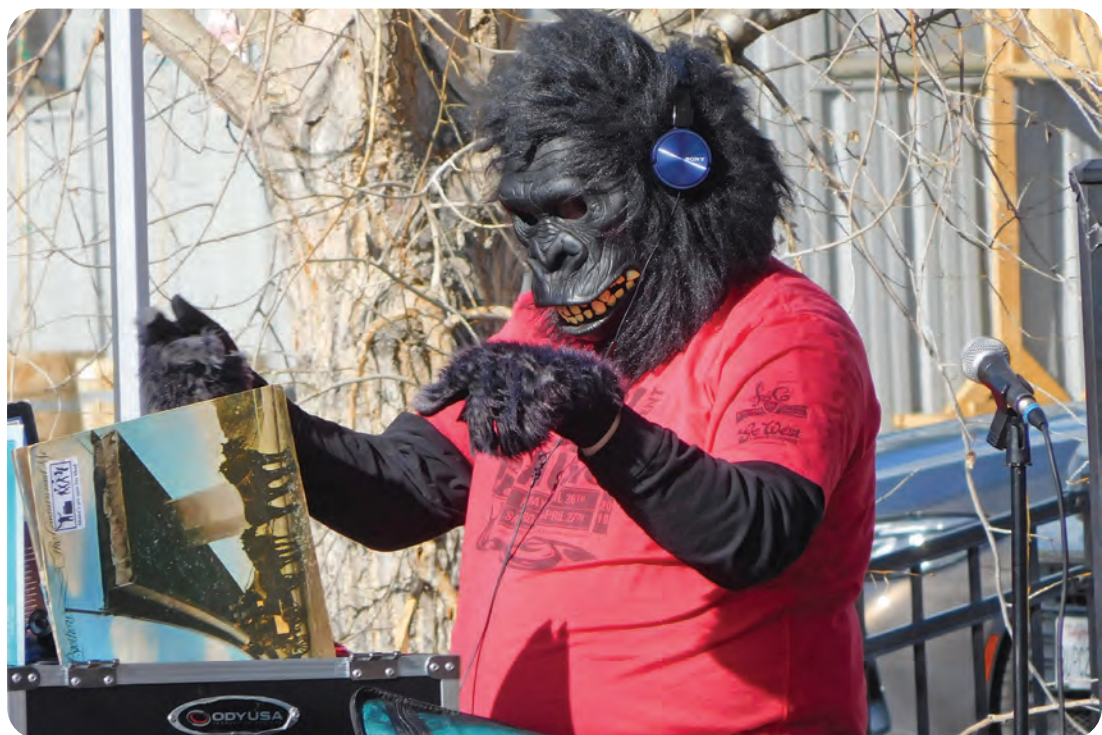
There's An Ape For That 2022