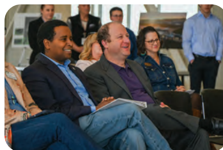
Gov. Polis and Congressman Neguse at Aims Community College Flight Training Center

Recently, Colorado Governor Jared Polis and Congressman Joe Neguse visited regional sites showcasing Colorado's innovative and creative use of landmark American Rescue Plan Act (ARPA) funds in Northern Colorado as a part of the