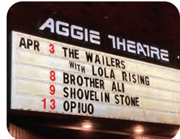
The Aggie marquee

Best Reggae Album category. Sunday night's encore featured the popular single from that album called "One World, One Prayer", which was written by famed producer Emilio Estefan. It really was a phenomenal show and despite being formed in Jamaica and despite being around since the 70's and having undergone tremendous lineup changes and transitions, they still do a great job of making each performance intimate and personal, making everyone on the dance floor feel as though they've been along for the entire ride. The Wailers are still out on tour at the moment, so if you missed them this time around you should definitely keep an eye on their upcoming dates. And while you're at it, be sure to keep the other eye on the Aggie's calendar, as well because they have a lot more exciting shows on the way!