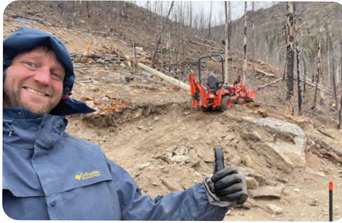
Climbing a hill with the Kubota

My team and I started small and chipped away at the rocks and boulders (representing the problems). We move those "rocks" every day, and now we have started to climb the mountain. The mountain in North Forty News' case was expansion -- to form Northern Colorado's only regional