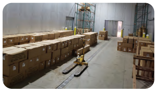
2022 boxed seedlings

Photos are of planting in the Boulder Ranger District and delivery of seedlings to the Canyon Lakes Ranger District.