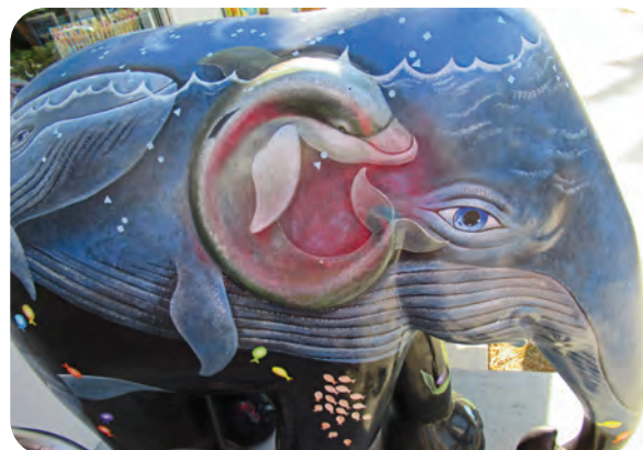
Elephant Parade art work Dana Point