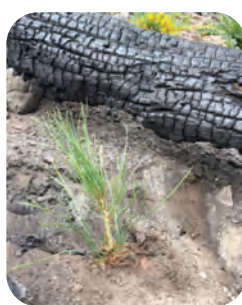
Freshly planted seedling

The Arapaho and Roosevelt National Forests have partnered with the National Forest Foundation to plant approximately 400,000 seedlings in June within burn areas from the five large fires of 2020 that burned over 25% of the Forest.