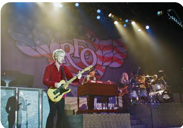
REO Speedwagon joins Styx and Loverboy at Ball Arena on July 8