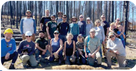
Hach Volunteers

UNITED WAY OF LARIMER COUNTY | Uwaylc.org