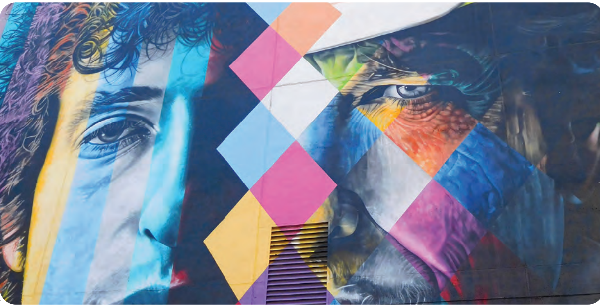
Bob Dylan mural in Minneapolis 2022- Dylan has four upcoming shows in Colorado