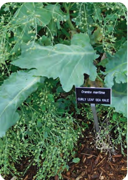
Curly Leaf Sea Kale

There didn't seem to be any better place to start than the recent Xeriscape Garden Party at the Fort Collins Xeriscape Demonstration Garden, located at 300