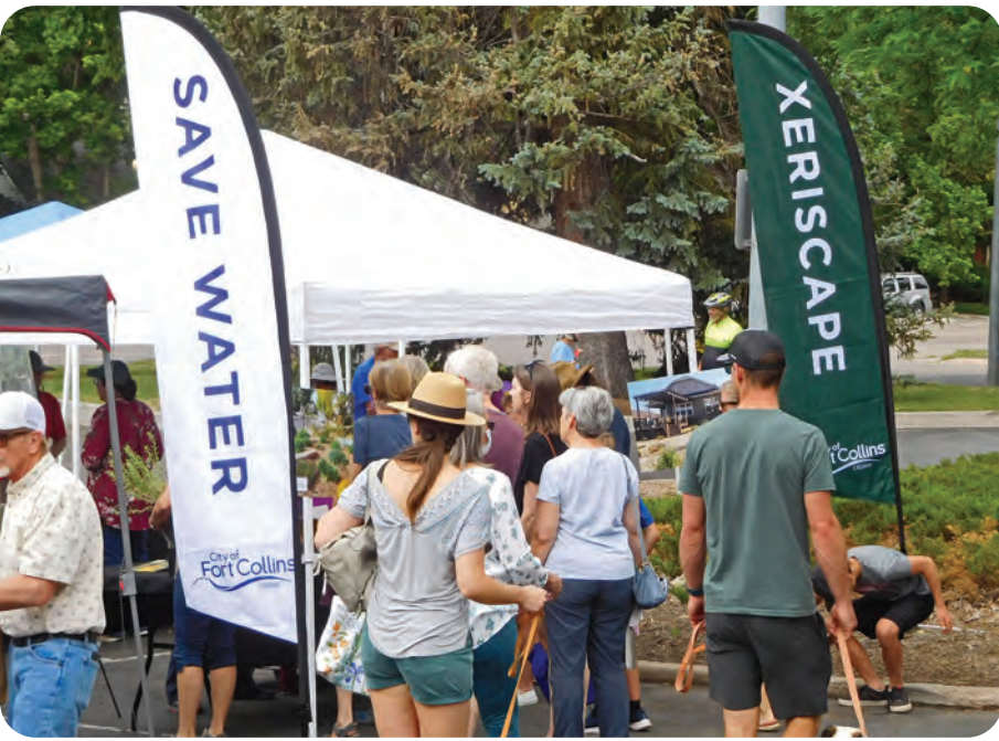
Xeriscape Garden Party 2022

I have been pretty dutiful about mowing my lawn. If you look at yard work as exercise, then I have gotten a lot of exercise over the years.