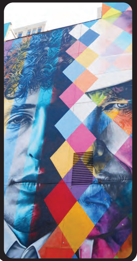
Bob Dylan mural in Minneapolis 2022- Dylan has four upcoming shows in Colorado