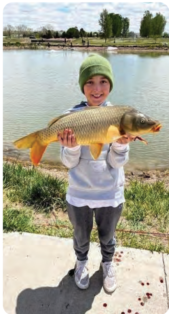
Biggest fish caught in the Derby