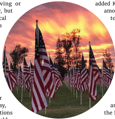
Field of Flags at sunset

Rotary International is a global network of 1.2 million individuals who see a world where people UNITE and take ACTION to create lasting change – across the globe, in our communities, and in ourselves. Rotary Club of Fort Collins Breakfast was founded in 1989 and meets on Thursdays at 7 am. Through fundraising, member donations and volunteer hours, Fort Collins Breakfast Rotary has assisted numerous local organizations such as Food Bank for Larimer County, Meals on Wheels and Project Self-Sufficiency. For more information, go to fcbreakfastrotary.org.