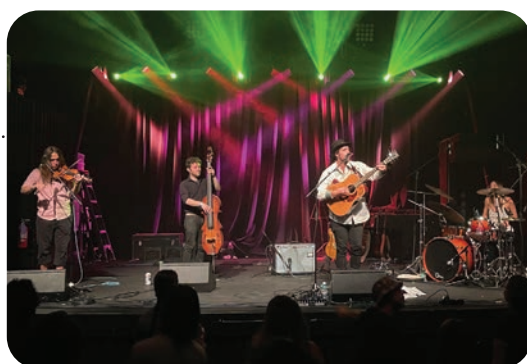
Banshee Tree

But Banshee Tree's sound, as described by its members, can't be pigeon-holed within