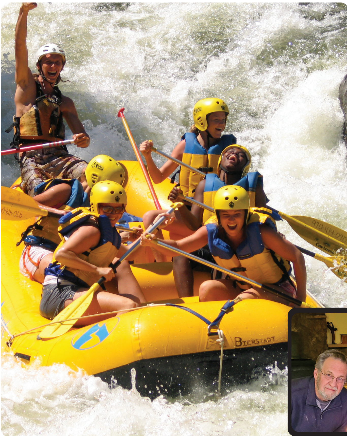
Mountain Whitewater fun