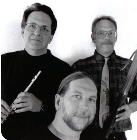
TVS and two fingers 1998

some tours on the East Coast. We were "alternative" performers and we played in a lot of "alternative" situations -- like performing from the steps of the Great Stupa of Dharmakaya as it was being built.