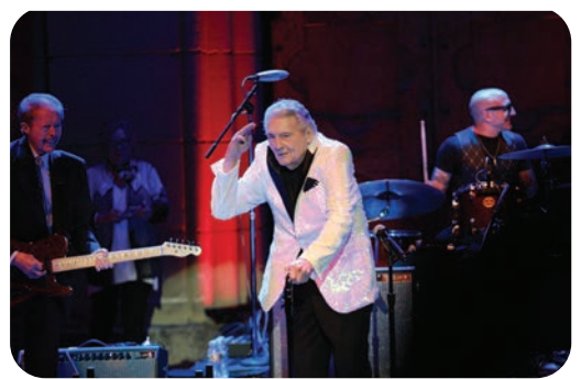
Jerry Lee Lewis

Lewis joins Sun Records compatriots Cash, "Cowboy" Jack Clement, Phillips, and Elvis Presley in the Country Music Hall of Fame. He is also the fourth member of the Rock and Roll Hall of Fame's founding 1986 class of inductees to also gain membership in the Country Music Hall of Fame, along with Presley (1998), the Everly Brothers (2001), and Ray Charles (2021).