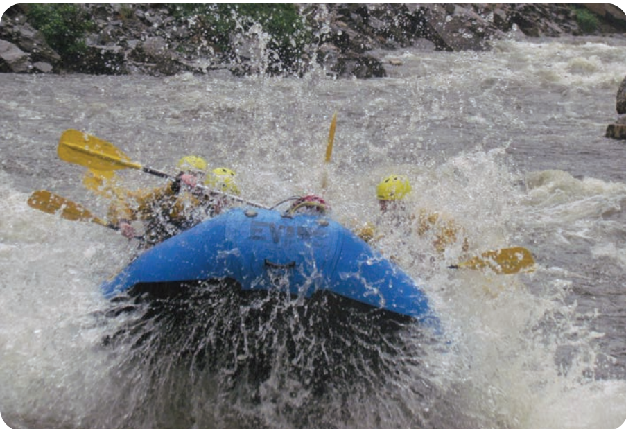
The splash (Photo courtesy of Mountain Whitewater & the Paddler's Pub)