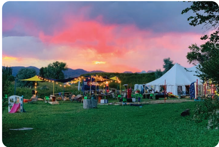
Paddler's Pub at sunset

Sun's out, fun's out! As the weather warms up, we know summer is only right around the corner, and right along with it comes all of our favorite outdoor Colorado activities; whether you're spending the day whitewater rafting, mountain biking along the trails, or simply checking out the sights around Fort Collins, The Paddler's Pub has proven year after year to be the best place in town to relax and unwind after a full day of excitement in the sun.