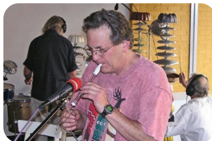
Sound Art Orchestra 2012

We took this out into public a number of times, allowing audience members to join us in long, otherworldly jams. Perhaps our most prestigious performance as SAO was a collaboration with Dance Express -- composing and performing a live soundtrack for original dance pieces, culminating in two grand performances at the Lory Student Center Theater at CSU.