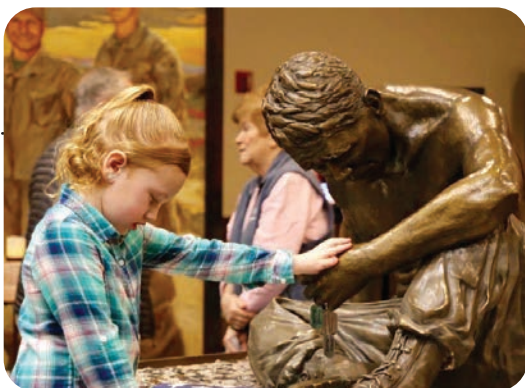
Eyes of Freedom Exhibit

In addition to the huge paintings, Miller has added a life-sized bronze entitled, "Silent Battle" which highlights the mental health crisis which some veterans experience. Interactive displays also provide opportunities for Veterans and civilians alike to engage personally.