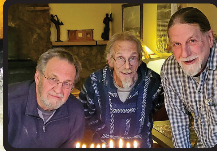
OoB 2022: "Playing With Fire (Still)"