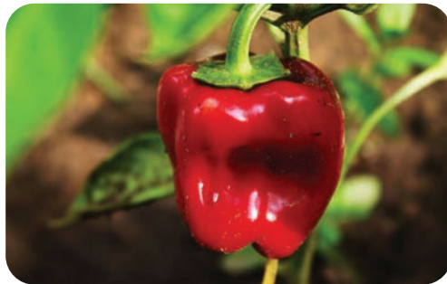
Red Pepper

Where you plant vegetables in the garden also matters. Certain plants make good neighbors because they provide shade and/or support, improve nutrients in the soil, attract pollinators, repel pests or help to prevent disease. Plants that climb should be given plenty of space so they don't choke out other crops. Many varieties of tomatoes and peppers also do well in large pots.