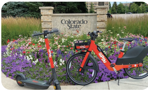
Spin bike CSU

Fort Collins residents can now streamline e-scooter and e-bike, rides with Spin via the Lyft app.