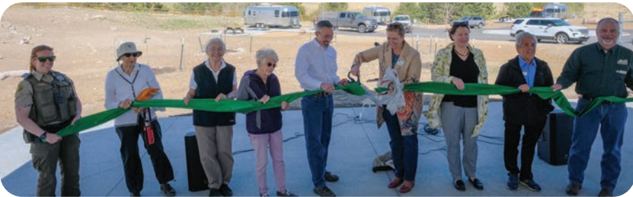
Officials gather to cut the ribbon and officially open Sky View Campground at Carter Lake.

Larimer County Department of Natural Resources (LCDNR) has announced the official opening of Sky View Campground, a new six-acre recreation development at Carter Lake reservoir, located along County Road 31 in Berthoud.